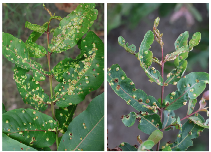
Fig. 2: Gall fly infested T. arjuna leaves