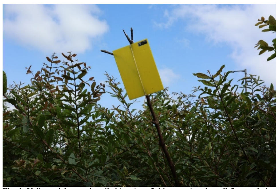
Fig. 1: Yellow sticky trap installed in arjuna field to monitor the gall fly population