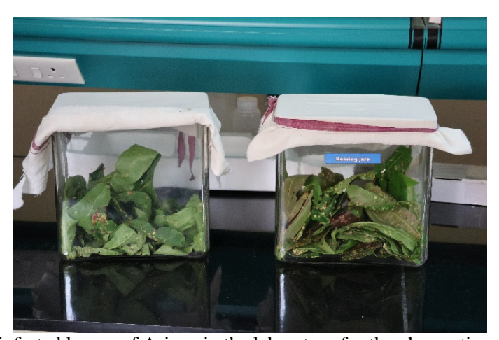
Fig. 3: Rearing of gall-infested leaves of Arjuna in the laboratory for the observation of parasitoid emergence